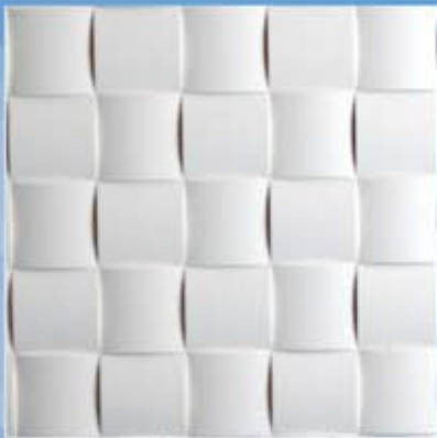
TITAN TWO INCH WEAVE